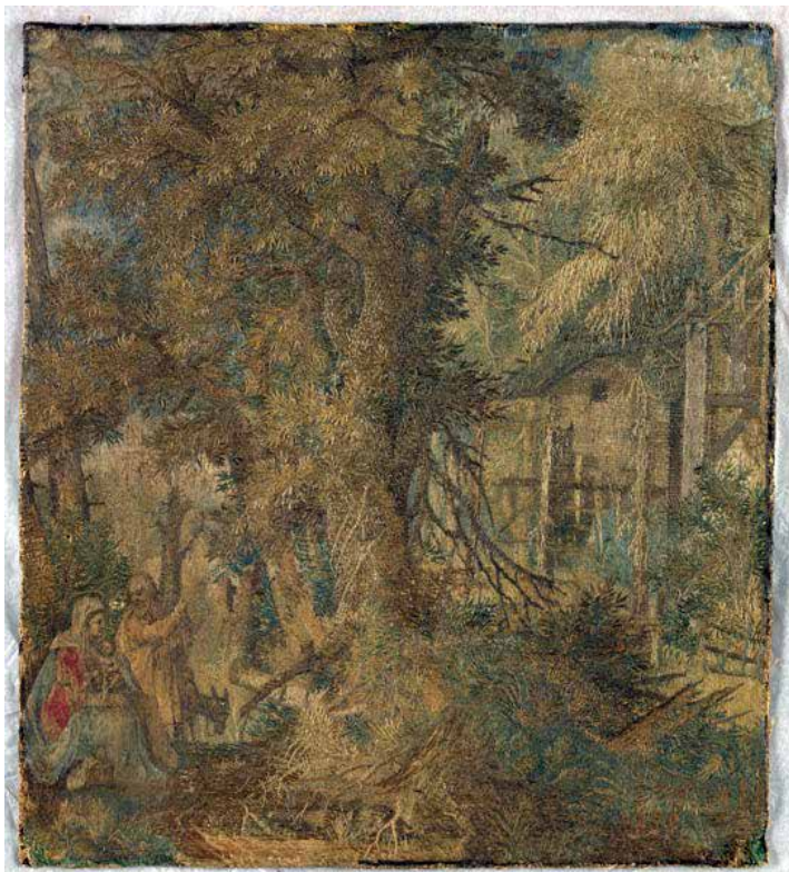
Fig. 6 Philips van den Bossche, Wooded Landscape with the Rest on the Flight into Egypt , ca. 1610, needlework, 31.7 x 28.2 cm. Private collection, The Netherlands.

part that should indicate the remains of a fachwerk (half-timbered) structure, an entwined thread with a dark, silver-like color can be discerned (fig. 7). 14 The rest of the needlework uses colored silk threads to create a vibrant image of Mary, Christ, and Joseph (fig. 8). Philips Van den Bossche used different stitches to produce this precious little work, which is so complex and detailed it might be termed a “needle painting.” 15 The sky, the background, and the figures were formed using a split stitch to suggest a smooth progression of the colors. The foliage of the trees and the grass are formed by stem stitches. The stable is formed by a layer of silk strand in which threads are applied on top of the structure and the stitches are alternatively sewn to suggest a brick pattern. The metallic threads are fastened to the needlework by couching stitches. By using this particular stitch it was possible to create a sparkly surface and add depth. 16