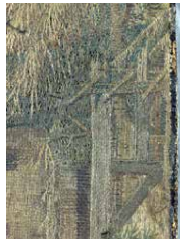
Fig. 7 Detail of fig. 6.