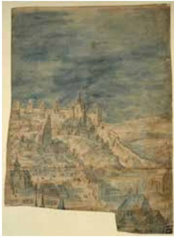
Fig. 2 Philips van den Bossche, Fragment of a Design for a "View of Prague," ca. 1605, pen and brown ink, with blue wash, the contours of two buildings on the recto traced in black chalk on the verso, irregularly trimmed on bottom and both sides, 324 x 232 mm (at widest points). Göttingen, Kunstsammlung der Universität, Graphische Sammlung, inv. no. H. 355.

whole gives a beautiful impression of both the size and splendor of the city of Prague during the reign of Emperor Rudolf II. Of its design only a fragment survives and is kept in the collection of prints and drawings at the University of Göttingen (fig. 2).