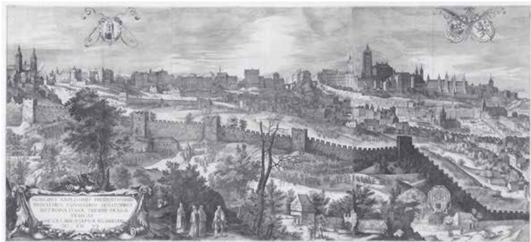
Fig. 1 Hans Wechter the Elder, after a design by Philips van den Bossche, View of Prague , 1606, etching, each of the nine sheets measures 473 x 355 mm.

Philips van den Bossche (fl. 1604-1615) was the court embroiderer to emperor Rudolf II in Prague. After the death of Rudolf in 1612 Van den Bossche is documented in Augsburg. Apart from a dozen drawings for various purposes, no needleworks have been known to survive. Published here is the first securely attributed needlework to Van den Bossche, a rare example of a work sewn in silk. 10.5092/jhna.2013.5.1.2