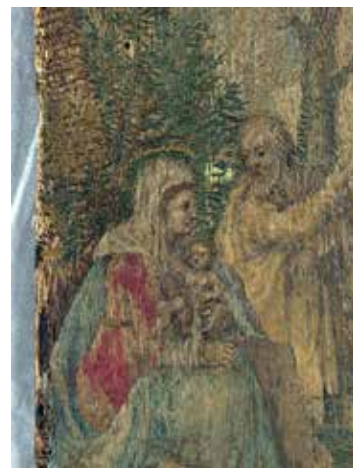
Fig. 8 Detail of fig. 6.