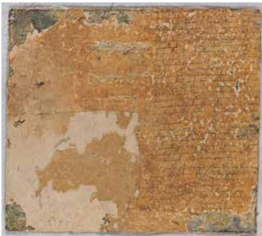
Fig. 10 Back of Wooded Landscape with the Rest on the Flight into Egypt (fig. 6).