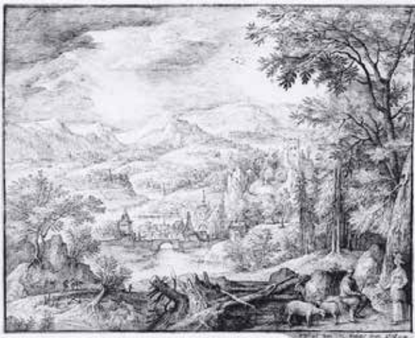
Fig. 3 Philips van den Bossche, Landscape with a Shepherd and the Sun Breaking Through, 1615, pen and dark gray ink on vellum, 146 x 184 mm. Signed and dated at lower right, in black ink, philips van den bosche fecit 1615 . Brussels, Bibliothèque Royale Albert Ier, inv. no. F 20225, f o .