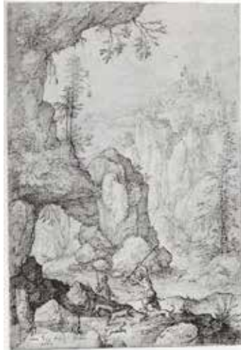
Fig. 4 Philips van den Bossche, Mountain Landscape with a Hunting Scene , 1609, pen and brown ink, 134 x 90 mm. Signed and dated at lower left, Philips / van den bosche fecit / 1609 . Berlin, Staatliche Museen zu Berlin, Kupferstichkabinett, inv. no. KdZ 12408.