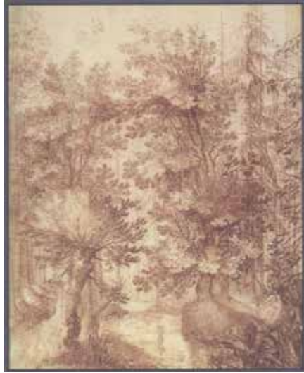
Fig. 9 Philips van den Bossche (?), Forest Landscape with Tobias and the Angel , pen and dark brown (iron gall) ink, framing line in black ink, 241 x 193 mm. Rotterdam, Museum Boijmans Van Beuningen, inv. no. N 52.